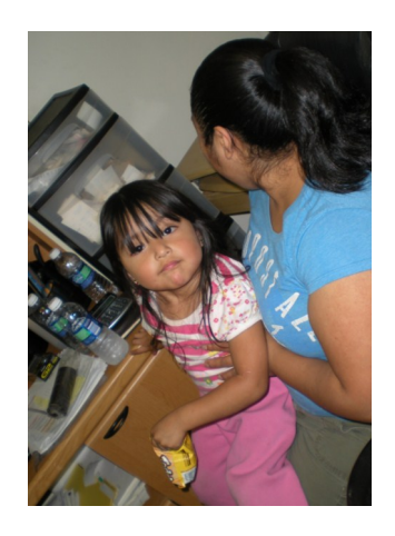
Waiting with Mom to do a Whole Child Profile