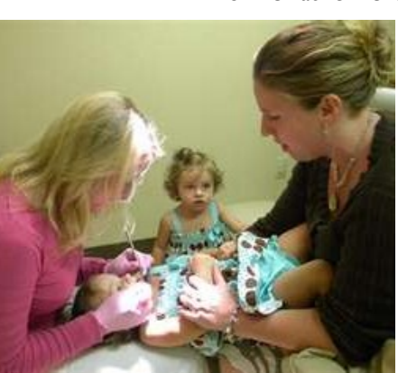
Dentists recommend taking an infant for a cavity risk assessment before their first birthday, even if no teeth are showing.

Brushing teeth twice a day used to be nonnegotiable, she said, but not anymore. "Some parents say: 'He doesn't want his teeth brushed. We'll wait until he's more emotionally mature.' It's baffling," she added.